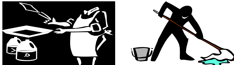
Examples of common hazards in the workplace

It is up to you to be prepared to identify hazards and to use proper safety equipment or practices. Ask your supervisor what type of safety program is in place to protect you and your fellow co-workers.